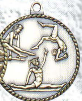
M167 F. GYMNASTICS