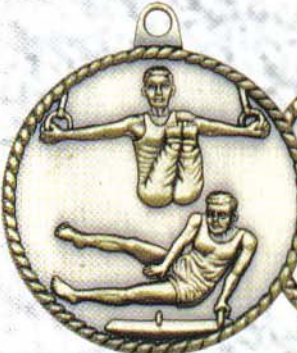
M166 M. GYMNASTICS