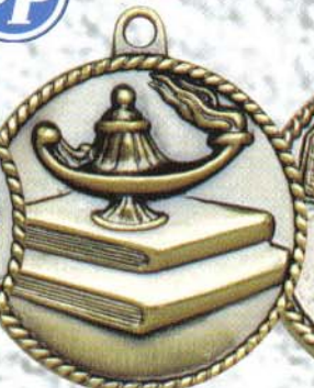
M119 LAMP of LEARNING